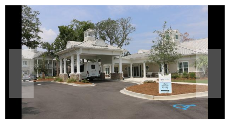
Wellmore of Daniel Island is a vocal advocate for Alzheimer's and dementia research.

HOME / NEWS / ADDRESSING ALZHEIMER'S DISEASE